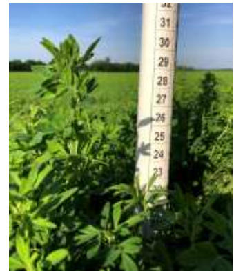
1 Alfalfa Austin Mb starting to lodge

Also as you get your first cut off I would really appreciate hearing how first cut fared as to yield and quality. Please email me with your comments at john@mfga.net include where you are located in the province if you don't mind.